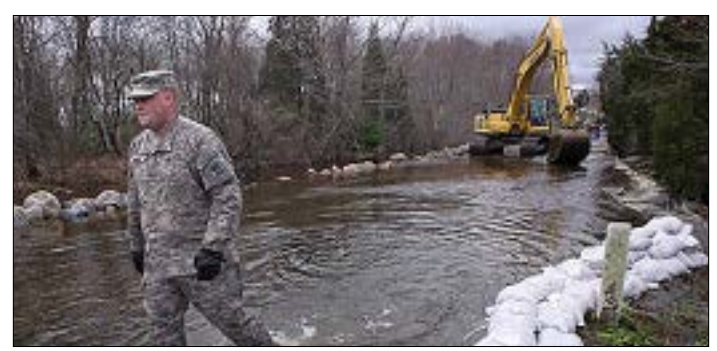
National Guard and heavy equipment cope with Great Flood of March 2010.

than in suburbs and rural areas. The effect