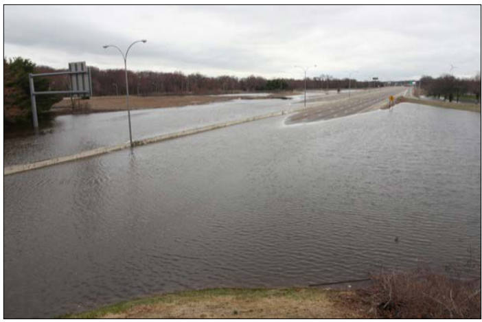
Water covering the airport connector in Warwick, during the Great Flood of March 2010.

That doesn't mean you have to worry yourself into a tizzy, but it makes a good argument for at least paying attention to what is evolving around you that can hurt you on a daily basis. And it begs the question: Are we doing all we can to mitigate or adapt to climate change?