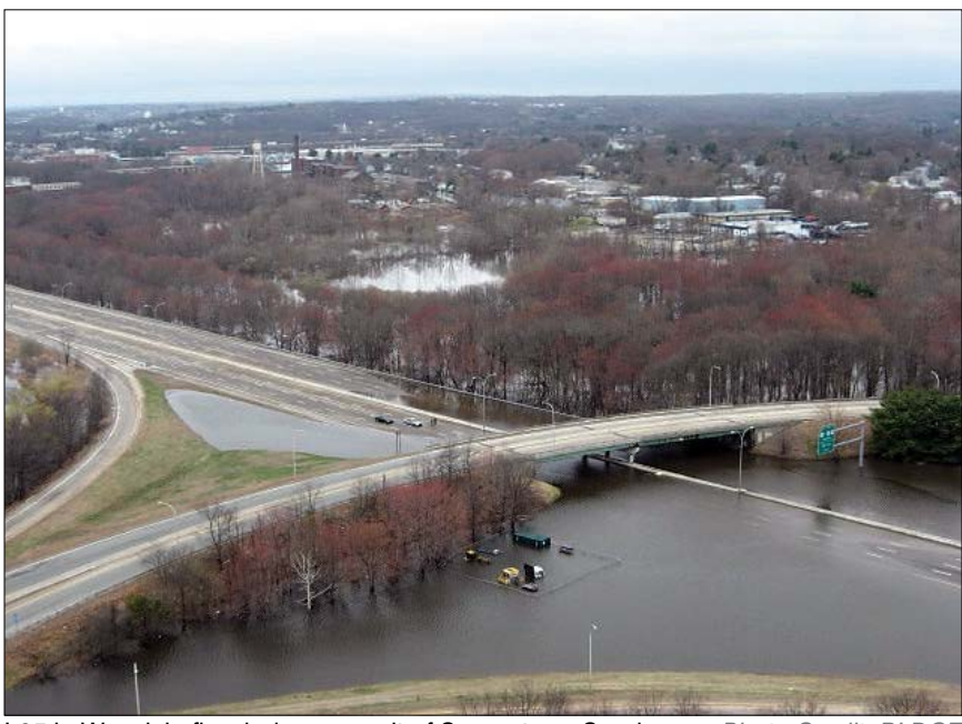
I-95 in Warwick, flooded as a result of Superstorm Sandy.

Researchers at the RI Department of Health estimated in 2010 that approximately 11 percent of Rhode