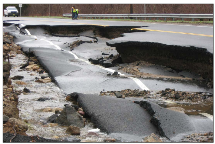
Part of the Nate Whipple Highway in Cumberland destroyed in the Great Flood of March 2010.

vulnerable public water supplies. Corollary damage from flooding, as the state experienced in 2010, saw massive amounts of polluted runoff and sewage plant overspill make their way into drinking water supplies, an often-overlooked occurrence when damage from the storm was assessed.